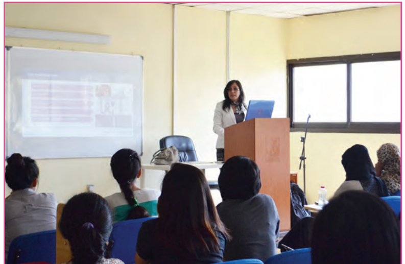
Breast Cancer Awareness

CUCA hosted a lecture on "Breast Cancer Awareness" in recognition of the Breast Cancer Awareness Month, on Wednesday, October 29, 2014.